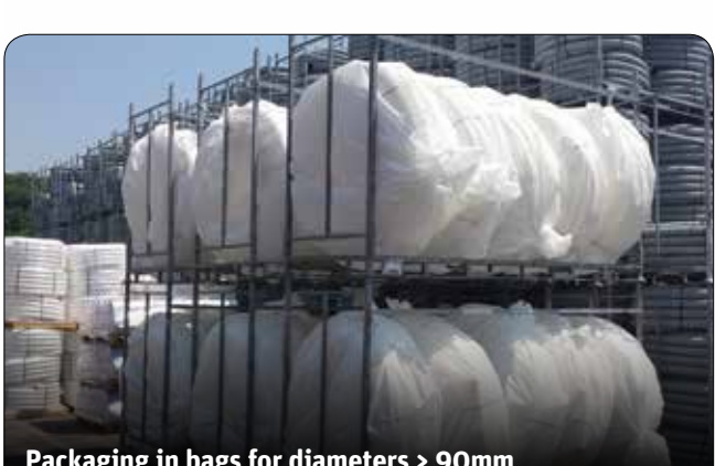
Packaging in bags for diameters > 90mm

To facilitate installation of FITT Air® on site, FITT has developed and registered an air flow marking which, thanks to a series of arrows, enables the installer to distinguish between delivery and return pipes.